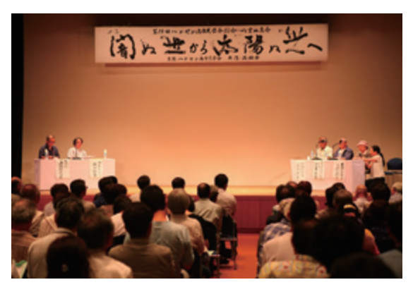
Testimony from former Ishigaki residents: "You just couldn't let on if someone in the family came down with leprosy."

Pointing out that self-stigma was a reason why some people refrain from seeking medical attention for ulcers and other injuries stemming from Hansen's disease, she recommended involving local social workers to help them access care.