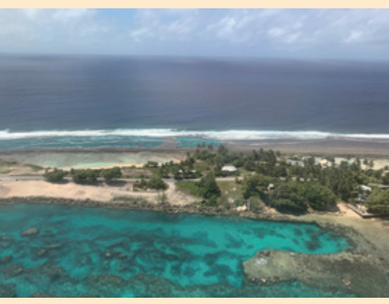
A press conference with Health Minister Kaneko; an aerial view of one of the Marshall Islands' many atolls and islands.