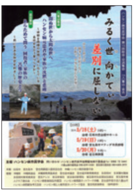
Poster for 15th general assembly of the Hansen's Disease Association for the People