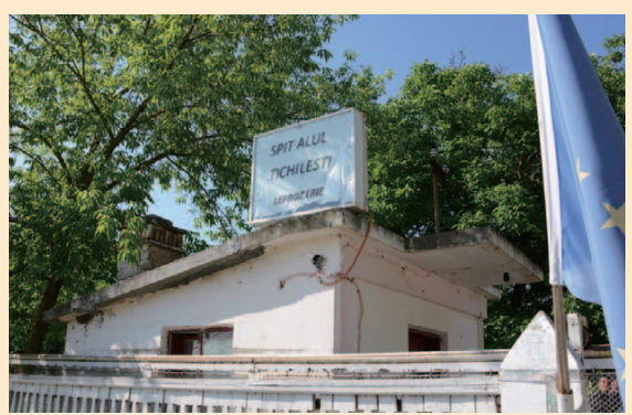
The sign at the entrance to the hospital

Romania's Danube Delta in the southeast of the country is home to 300 species of birds and 45 species of freshwater fish and is on UNESCO's World Heritage List. Less well known, but also part of our heritage, is the leprosy hospital at