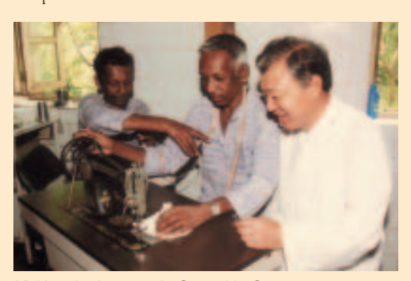
Visiting the Leprosaria Central in Goa

I also visited a state-run leprosarium established in 1934 by Dr. Froilano de Melo when Goa was a Portuguese colony. Set in some 60 acres amidst coconut palms, jackfruit trees and mango trees, it has plentiful greenery. At one time it had as many as 280 occupants but today has only 18 (11 women and 7 men), whose average age is between 70-80. It stopped accepting patients two years ago, and there is talk of eventually turning the complex into a hospital for HIV/AIDS or other diseases.