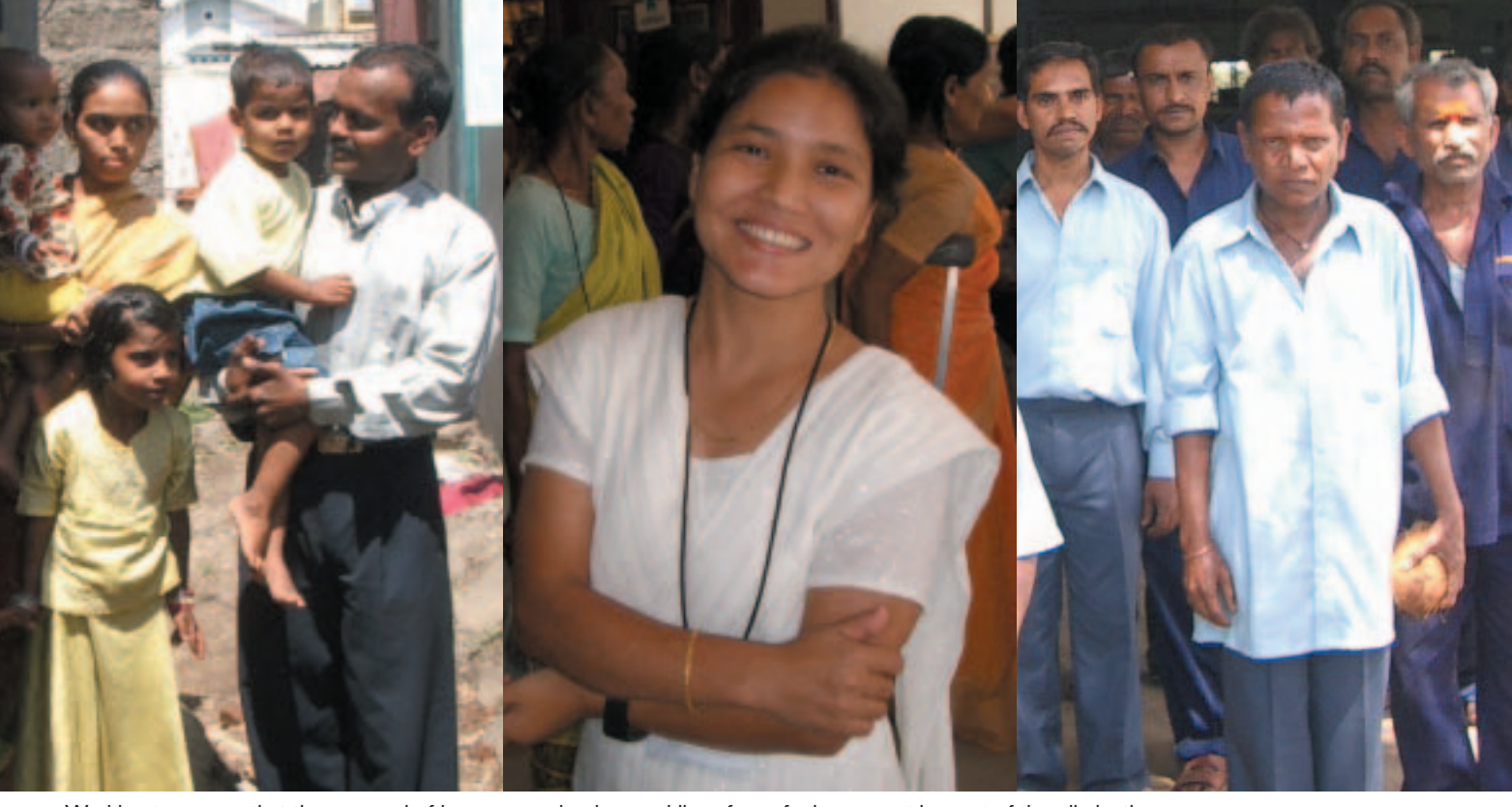
Working to ensure that those cured of leprosy can lead normal lives free of stigma must be part of the elimination process.